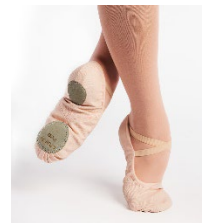
Pink/skin-toned ballet slippers