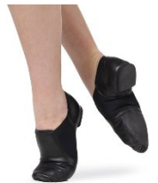
Black jazz shoes

Please wear black or skin toned undergarments (sports/dance bras).